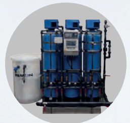
Triplex ion exchanger

In today's world of water purification, an ion exchanger is indispensable. For both the reduction of the lime content in tap water and the treatment of anaerobic spring water, an ion exchanger is an excellent option, depending on the choice criterion and the budget. Remon supplies ion exchangers of 1x 10 litres for the smallest civil application up to 3x 1000 litres for the larger industrial customers.