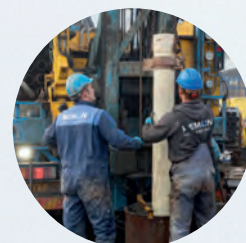
Our drilling masters

Almost all Remon water purifiers are equipped with smart control with network technology. This NT (Network Technology) control allows you, as a user, to entirely monitor the machine's operation in a graphical representation, to control it, and to trace it. When connected to internet or a 4g modem, Remon can log in to the installation and read it out, and, if required, adjust and operate it remotely.