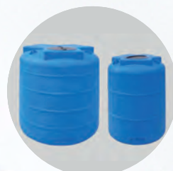
Water supply systems