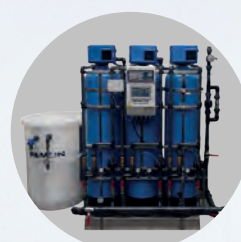
Triplex Ion exchanger