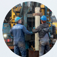
Our drilling masters

You want to have ample quantities of clean and pure water at any time of the day. That is possible with a plastic PE water tank from Remon. Our plastic storage tanks are light and strong, easy to install and very easy to clean. They are equipped with a spacious manhole, suitable for inspection of the inside of the tank and for maintenance. The RR2000 and RV models from 3000 litres have a manhole of no less than 55 cm!